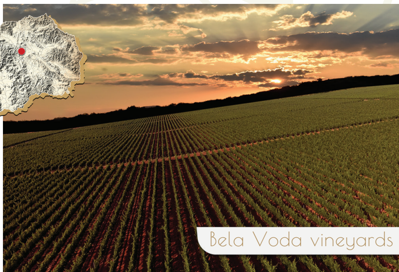
Bela Voda vineyards